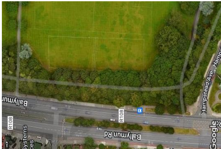
Existing park at location of proposed development

While recognising that some negative impact is unavoidable at this location, DCC will continue to work closely with TII to ensure that disruption is minimised and that park space and usage can be maximised for the local community during the construction period.